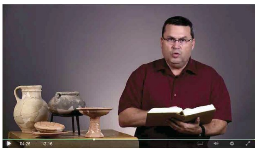
In the studio

The description above seems to raise a certain paradox: since teachers are required to transfer all their unique qualities – their teaching experience – to the online course, isn't the teacher redundant in the classroom? We believe that far from becoming redundant, the teacher's presence is more significant than ever. Contrary to the concern that we may be stripping teachers of their essential assets, and leaving them exposed in the classroom, we are in fact freeing them from a heavy burden that has always hampered the teaching process: the time previously devoted to passing on knowledge can now be dedicated to managing classroom dynamics, creative teaching, and, under suitable conditions, even personal support for each student's style of learning. Unshouldering the burden of passing on content, the teacher expands the tools at his/her disposal in the classroom, making room for better acquaintance with the class and students, and focusing on the essence of his/her profession – teaching. This in accordance with the principles of the constructivist educational theory, which describes a learning environment devised to build knowledge, rather than transfer knowledge<sup>7</sup>, and includes a vast range of creative approaches, such as in-depth investigation, enrichment, examples, gamification or any other methodology.